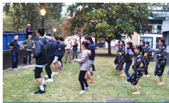
Practicing formations before the performance