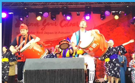
On stage with kenjinkai members