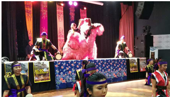
Members performing along with the instructor's lion dance