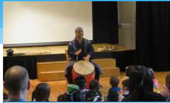
Okinawan music experience at Tulip Japanese School