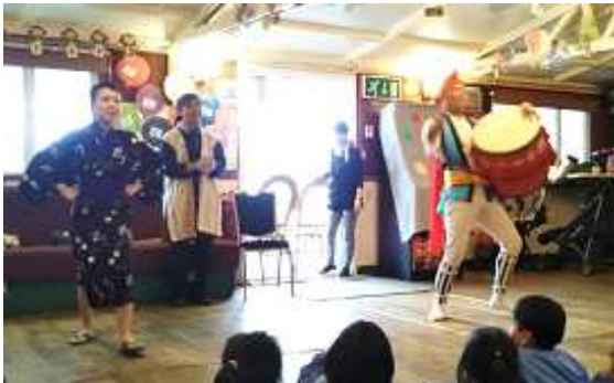
Students entranced by Sonda Seinenkai's eisa performance