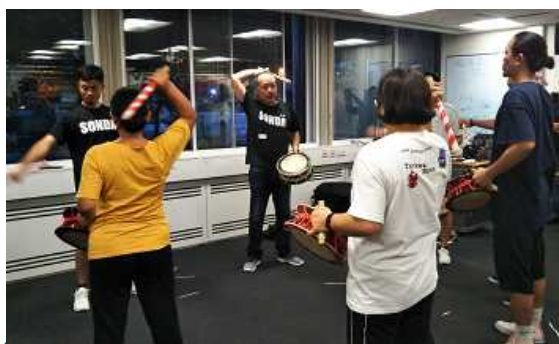
Miyazato-San taught dances in addition to sanshin and singing