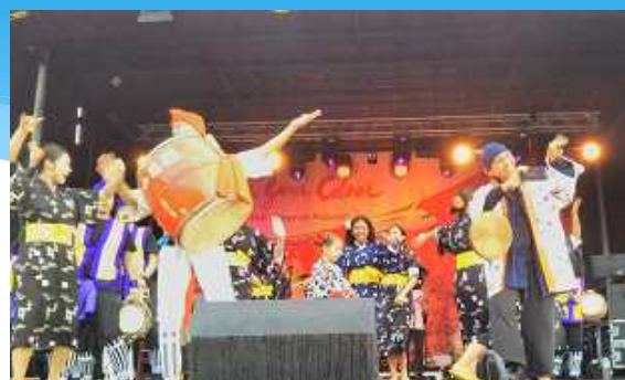
Rounding out the finale with kachashii!