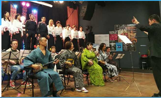
“Nada Sousou” performed by sanshin and the Sakura Choir group