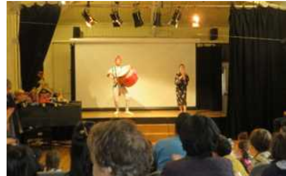
Acting as ambassadors for Okinawan culture