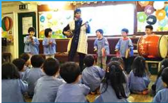
Musical instrument experience at London Bunka-yochien