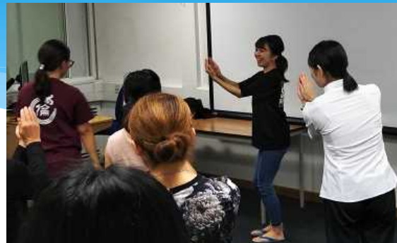
Everyone very interested in the fluid movements of the women's dance