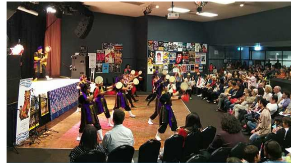
The eisa performance wows the crowd!