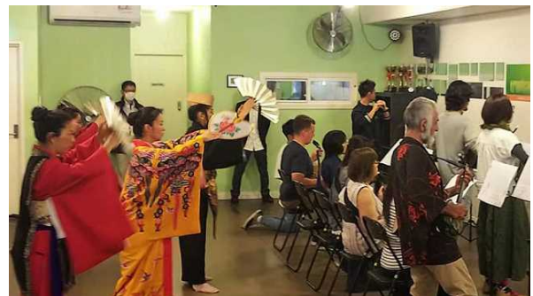
Concentration by both instructors and performers