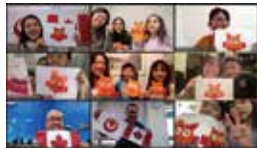
March 2024, Online event.

The Okinawa Kenjinkai in Canada requested an event for preschoolers and elementary school children. In response, we collaborated with an Uchinanchu from Peru to host a workshop where participants made Shiisaa figures using origami.