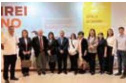
June 2023, Renewal of Memorial Day exhibition at the Japan-Peru Cultural Center

- We received a consultation from the Okinawa Kenjinkai in Peru and provided support, including information sharing and event assistance related to Irei no Hi (Okinawa Memorial Day).